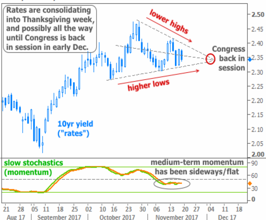
US 10yr Treasury Yield

In the spirit of "waiting and seeing," interest rates improved slightly this week. This keeps them locked in a consolidative trend (higher lows and lower highs) that's been underway for more than a month. It's the bond market's way of expressing indecision, and for now, the trend suggests indecision could linger at least through early December. Even if we apply some esoteric math to recent rate movement and derive a line that measures momentum, that line has been almost perfectly flat for several weeks.