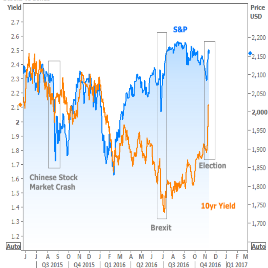
Stocks vs Bonds

By a decisive margin, the last 2 days of this week were the worst 2 days for rates since the taper tantrum in June 2013. The existing uptrend in rates was completely shattered, and history suggests there's still a chance of more pain ahead.