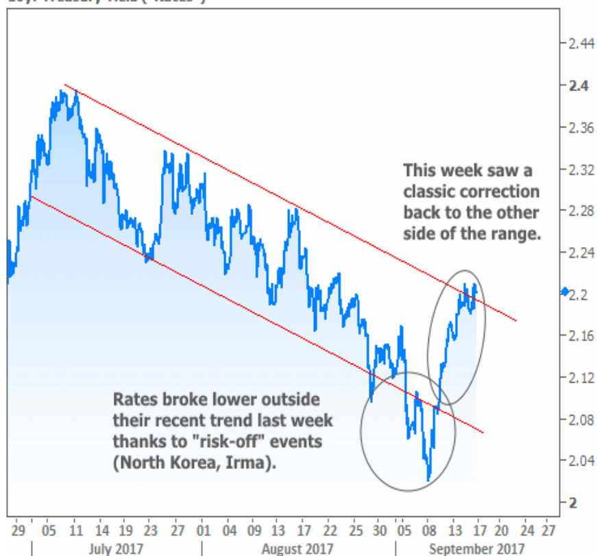
10yr Treasury Yield ("Rates")

The bulk of the correction took place during the first 3 days of the week. Rates found a supportive ceiling around 2.22% in terms of 10yr yields, but weren't interested in moving much lower for a few reasons. The most obvious reason would be that last week's gains were based on temporary factors.