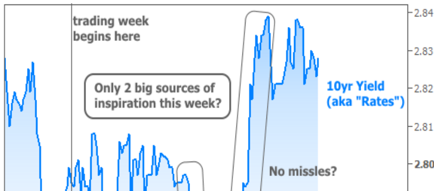
Stocks vs Bonds

The 2nd and 3rd panes of the chart put the Tweets into context and will be discussed below.