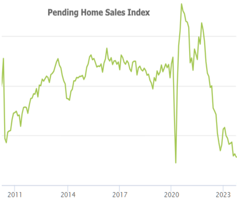
Pending Home Sales Index

It's a similar story for interest rates. 2022 was marked by the largest change in mortgage rates in a single year since 1981, but 2023 took the outright levels just a bit higher.