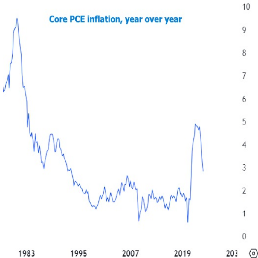
Core PCE inflation, year over year

While it's no longer necessarily a top priority, the Fed would also not mind seeing some more slack in the labor market and some other signs of economic weakness to bolster the case for further disinflation. If the economy is too strong, they need to wonder if inflation might pick back up.