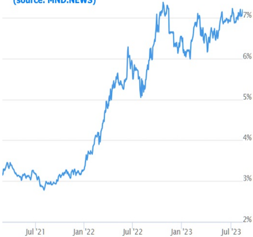
30yr fixed mortgage rate index

This is the new and persistent reality until one of 3 things happens: